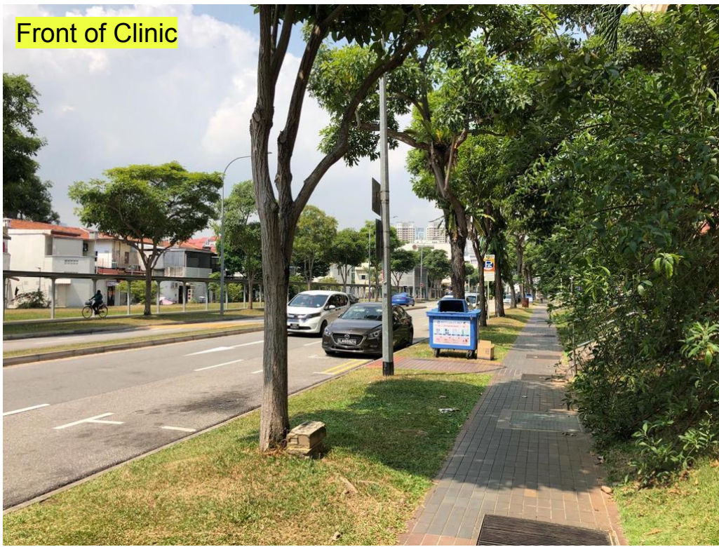
Front of Clinic